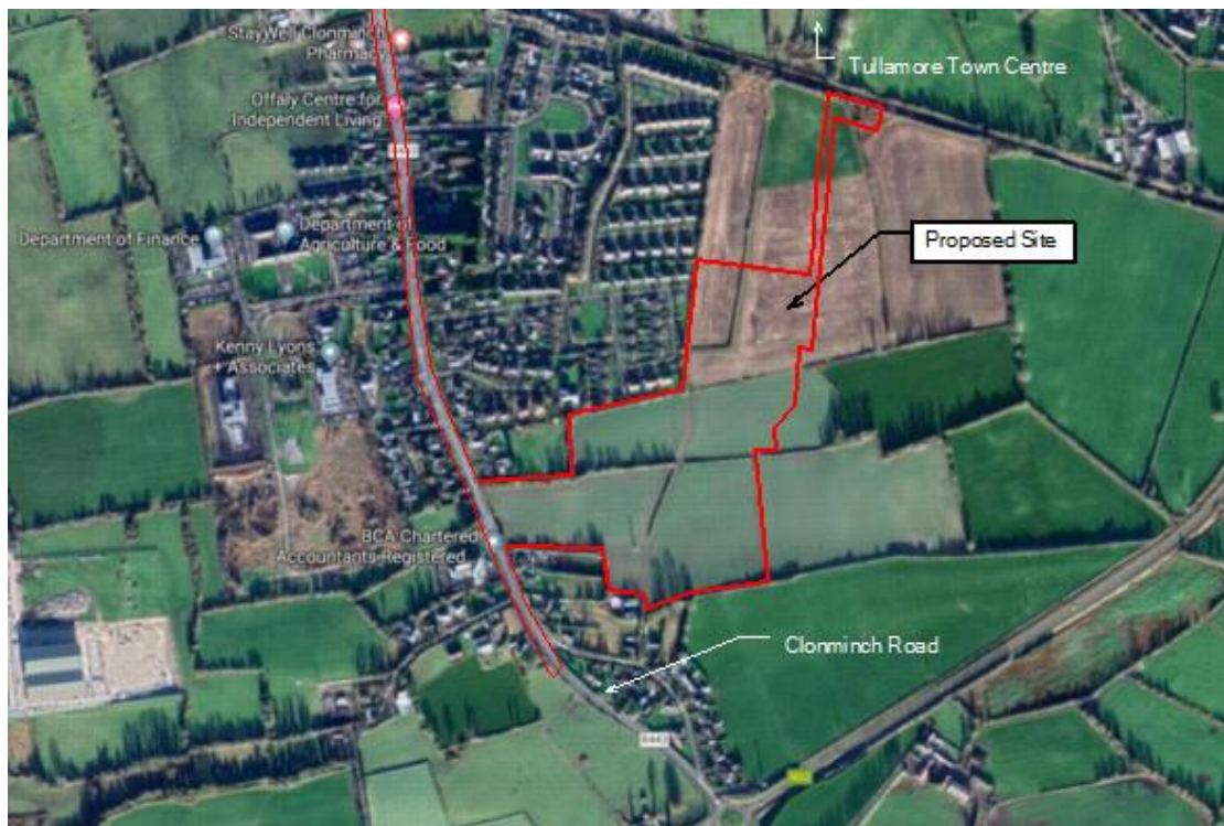
Figure 1.1 - Site Location Map (Site Boundary Indicative)

The site is bound to the south-west and north-west by existing residential development. The Dublin to Galway railway line is located to the north of the site. Lands to the east and south of the site are currently greenfield and fall within the Eastern Node of the Southern Environs of Tullamore as defined by the Tullamore Town and Environs Development Plan.